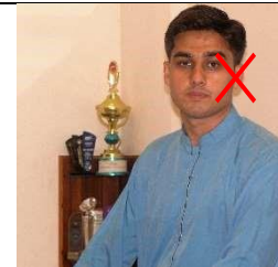
Background or scenery